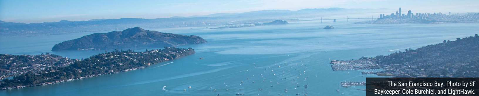
The San Francisco Bay.